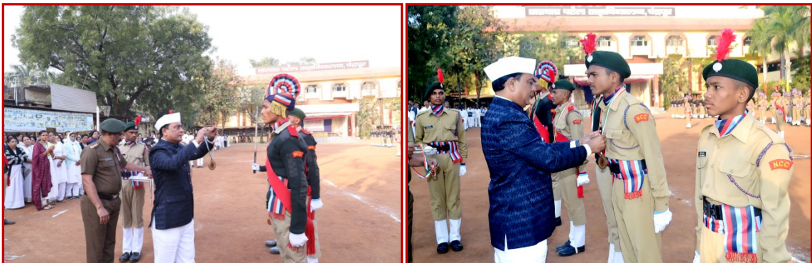
All this Cadets received Medals for their outstanding contribution in 2023-24