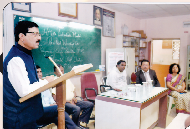
Department of Microbiology & Biotechnology Organised Workshop on Polymerase Chain Reaction on 3rd Feb. 2020