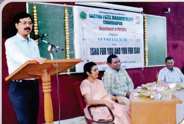
Department of Physics Organised guest Lecture on "ISRO for you and you for ISRO"