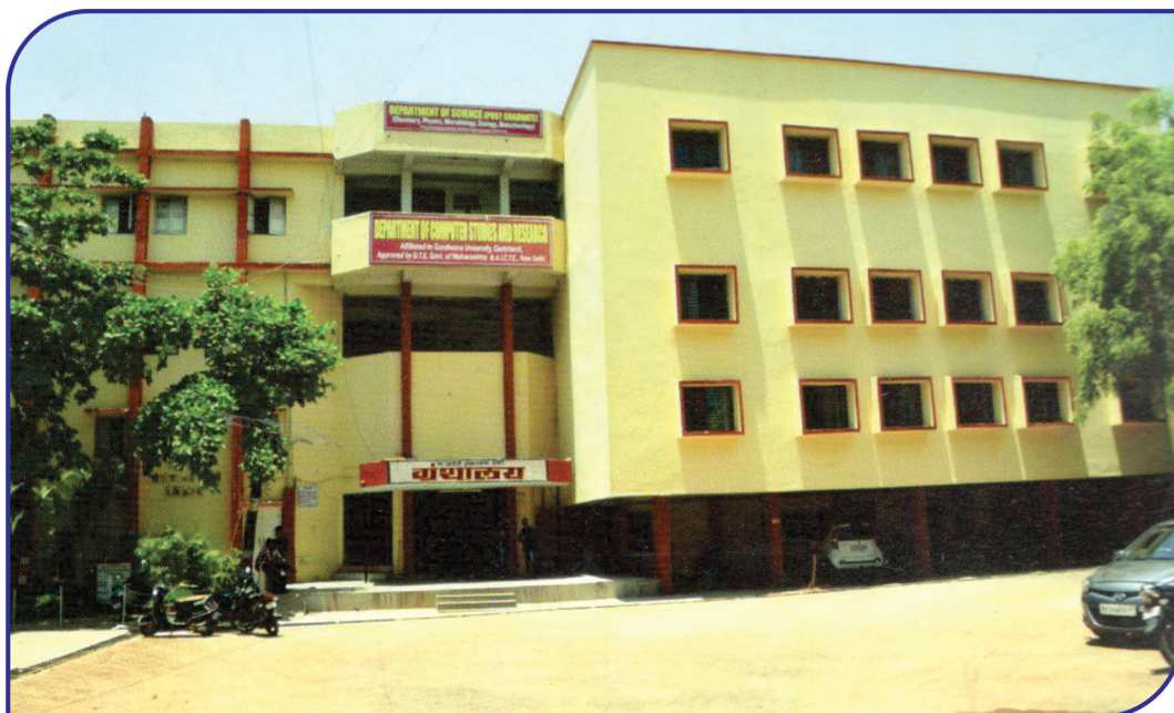
Library Building & Post Graduate Department of Science