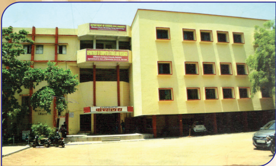
Library Building & Post Graduate Department of Science